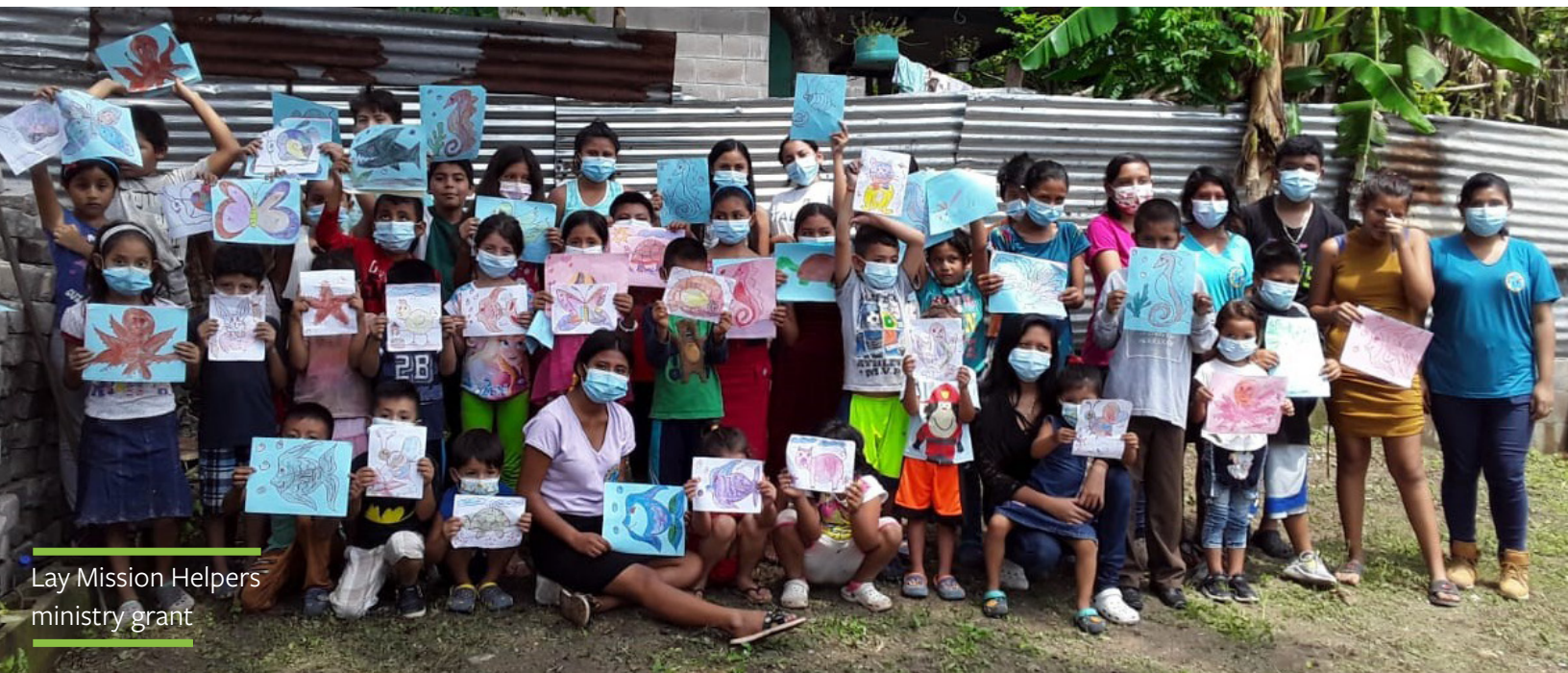
Lay Mission Helpers ministry grant