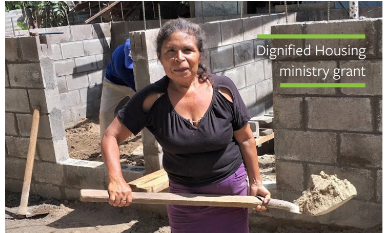
Dignified Housing ministry grant

When sisters and affiliates bring an FSPA ministry grant to their local group/companion community for discussion, the conversation becomes an important part of strengthening the grant request. A particularly strong grant is one that is inclusive, innovative and shows a personal connection between the sponsor and the organization. In the last fiscal year, donations to FSPA supported 126 ministry grants.