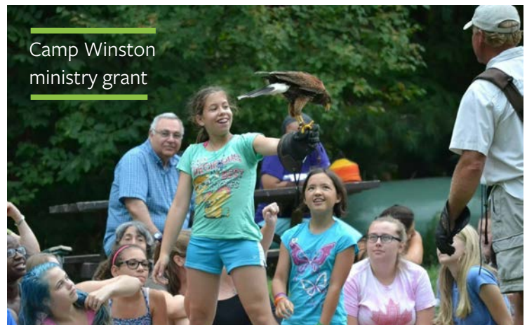
Camp Winston ministry grant